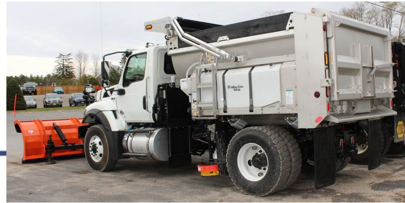
Body Mounted Liquid Tanks Option