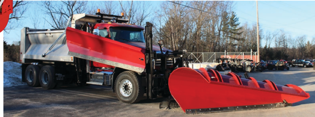
Integral Fenders Option