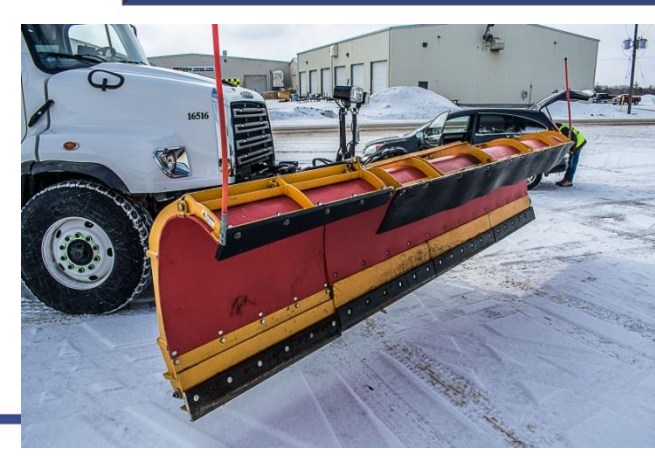
Extension fully deployed for seamless moldboard