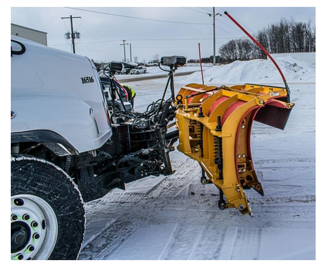
Extension fully retracted