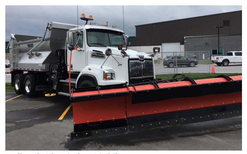
Full curbside window visibility