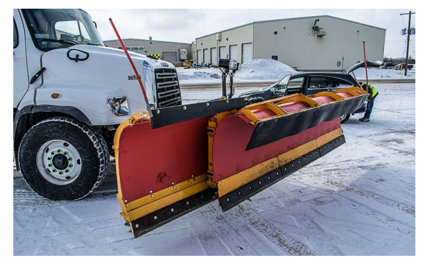
Plow with partially deployed extension